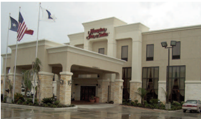
Two DryCool units were installed to treat all three floors of the Hampton Inn in Katy, Texas.