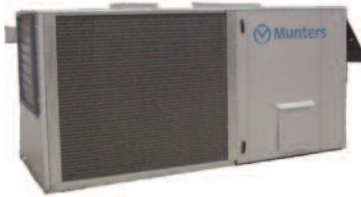
Directly Above: Conditioned make up air is delivered throughout the corridors and is distributed to each room and the lobby of the Hampton Inn & Suites in Katy, Texas. Left: Munters DryCool unit prevents mold, mildew, and structural/material deterioration. The all-in-one DryCool unit constantly controls temperature and humidity in the hotel.

higher initial cost, the energy savings and moisture prevention are incomparable," McMillan said.